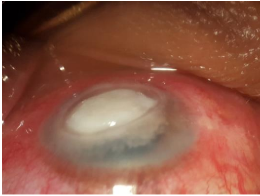
Fig 1: Recalcitrant fungal keratitis showing dense stromal infiltrate